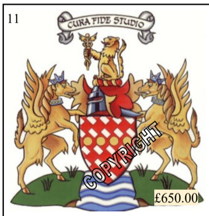
11 Consignia PLC £650.00