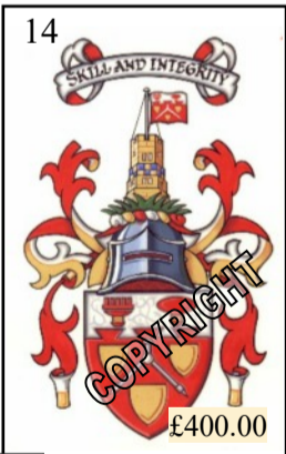
14 The Guild of Master Craftsmen Ltd £400.00