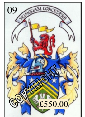
09 Trump International Golf Club Scotland Limited £550.00