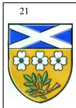
21 The St Andrew's Society of the Middle South

All the arms on these pages are actual commissions and therefore subject to copyright ©.