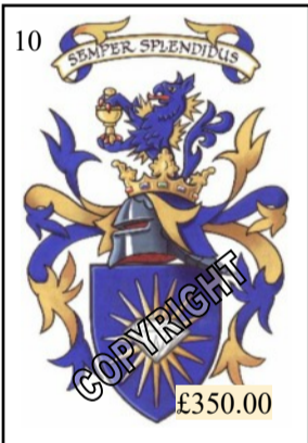
10 The Company of Master Jewellers Ltd £350.00