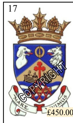
17 Burgh of St Monans Community Council £450.00