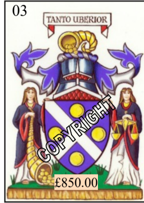
03 Bank of Scotland £850.00