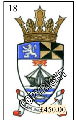
18 Oban Community Council £450.00