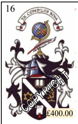
16 Fitzpatricks Ltd £400.00