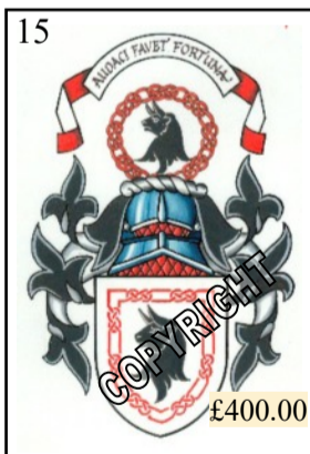
15 Turnbull Clan Association Inc. £400.00