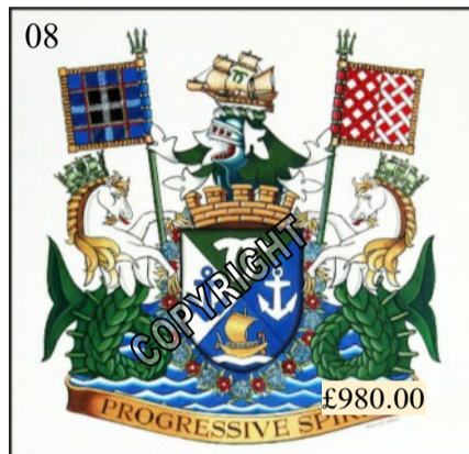
08 The City of Kobe £980.00