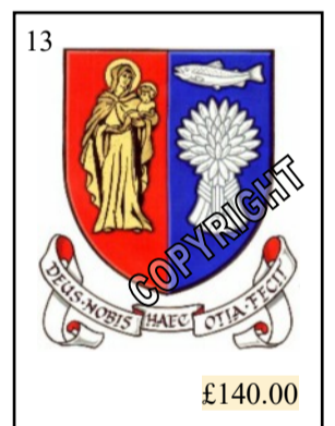
13 Banff Town & Country Club £140.00