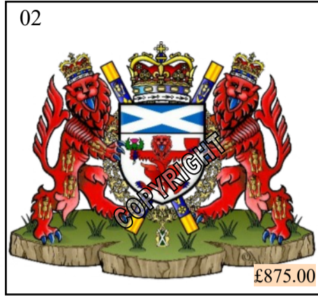
02 Court of the Lord Lyon £875.00