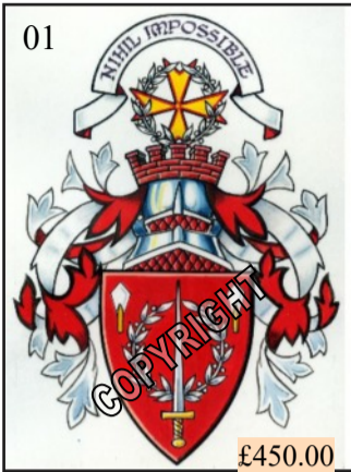
01 Charles Church Developments Limited £450.00