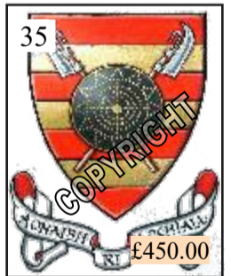
Clan Cameron Association