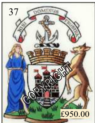
City of Edinburgh