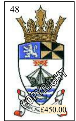
Oban Community Council