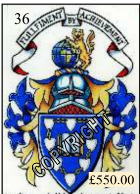
The International Register of Arms