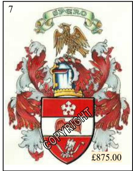
18 th century Scottish