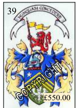
Trump International Golf Club Scotland Limited