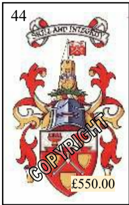
The Guild of Master Craftsmen Ltd