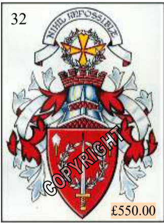
Charles Church Developments Limited