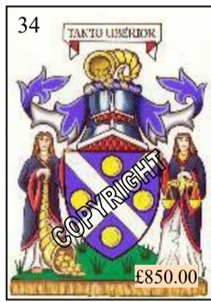
Bank of Scotland