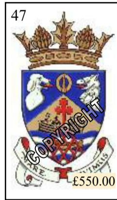
Burgh of St Monans Community Council