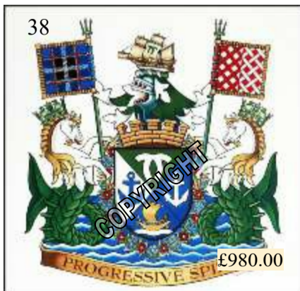
The City of Kobe