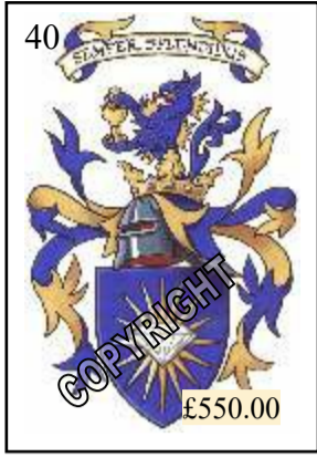
The Company of Master Jewellers Ltd