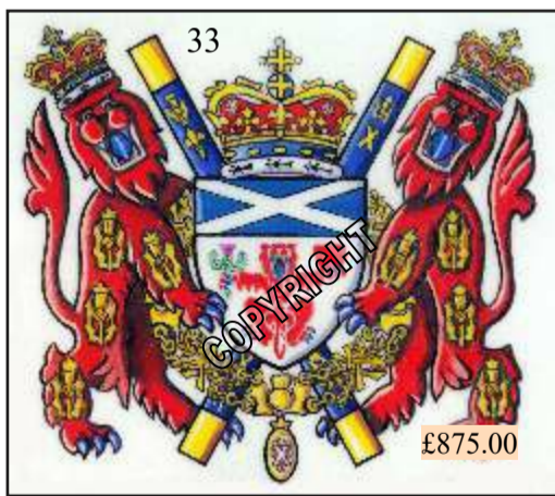
Court of the Lord Lyon