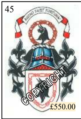
Turnbull Clan Association Inc.