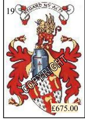
Arms with Baronial additaments